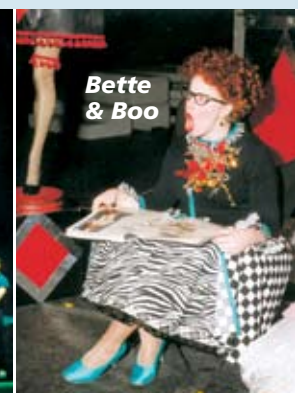
Bette & Boo