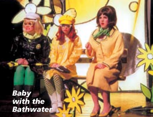
Baby with the Bathwater