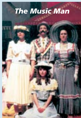
The Music Man