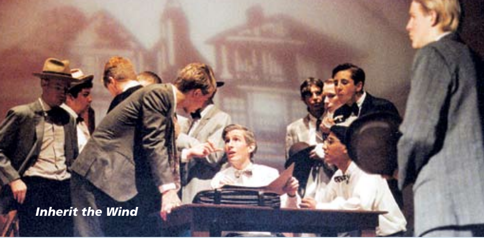
Inherit the Wind