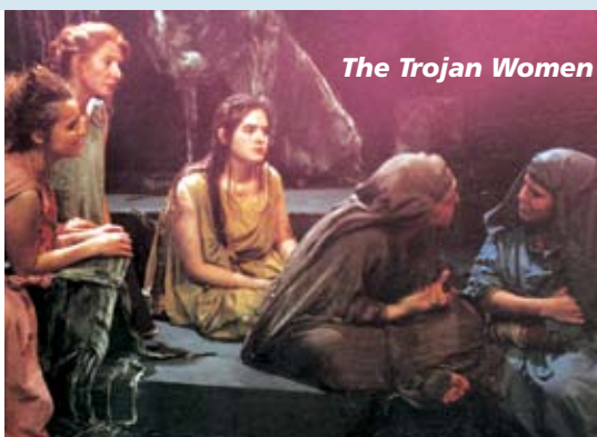
The Trojan Women