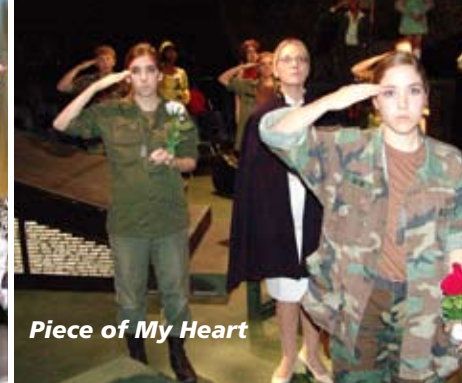
Piece of My Heart