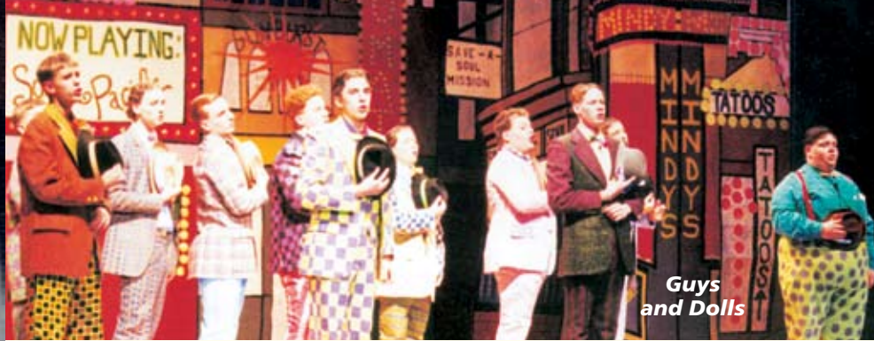
Guys and Dolls