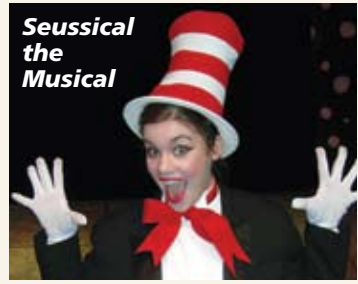
Seussical the Musical