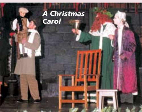
A Christmas Carol