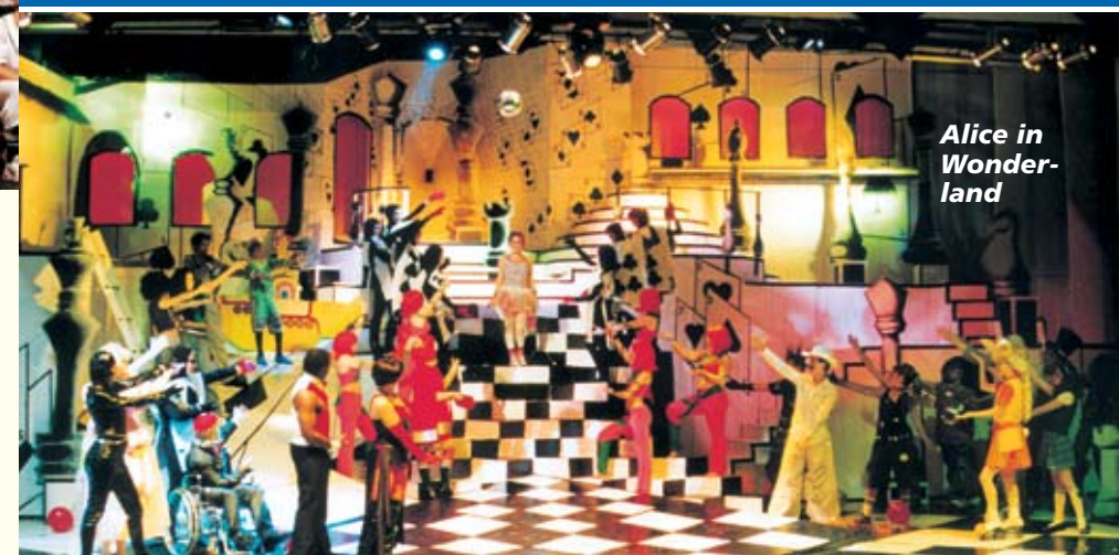
Alice in Wonderland